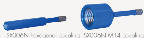
SX006N hexagonal coupling SX006N M14 coupling